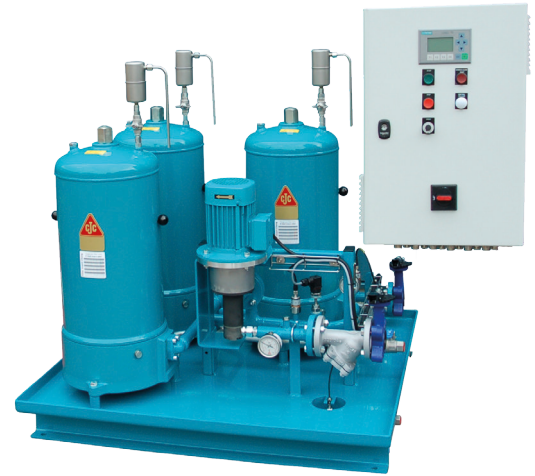
The CJC™ Marine Lube Oil Purifier 27/54, 3 stay version

The CJC™ Marine Lube Oil Purifier can deliver 500-3000 l/h of clean, dry lube oil, enabling operation on very large engines. With a filtration rating of 3/0,8 micron and removal of water and varnish/soot, the CJC™ Filter Inserts reduce the wear on engine parts. The simple design means easy maintenance and uncomplicated operation without sludge production. Being, in principle, an off-line solution, the quality of lube oil is unparalleled.