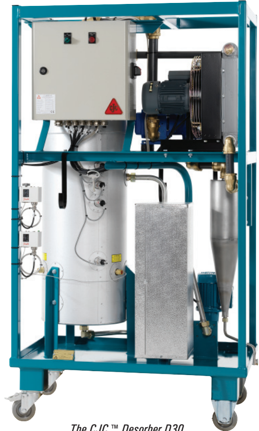
The CJC™ Desorber D30