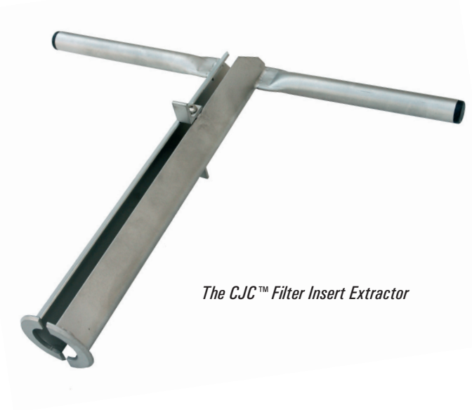
The CJC™ Filter Insert Extractor