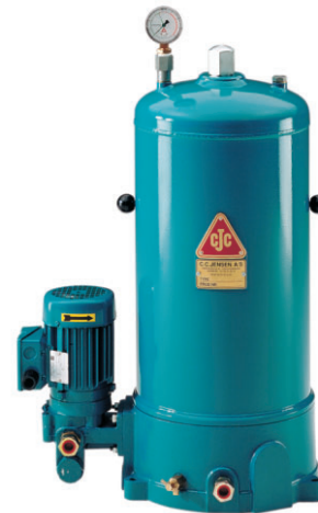
The test oil - and thus the cylinders - are cleaned through a CJC™ FineFilter HDU 27/54 and controlled by a UCC automatic particle counter.