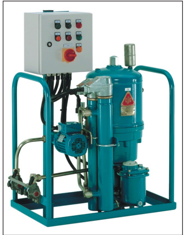
CJC™ Filter Separator Unit PTU2 27/27 PM-DH1PW

The remarkable in this case is the speed in which the CJC™ unit was able to reduce the water content in the oil. In less than 48 hours the state of the oil was brought from "not usable" to "usable" and a considerable amount of solid particles was removed as well - including resinous oxidation products.