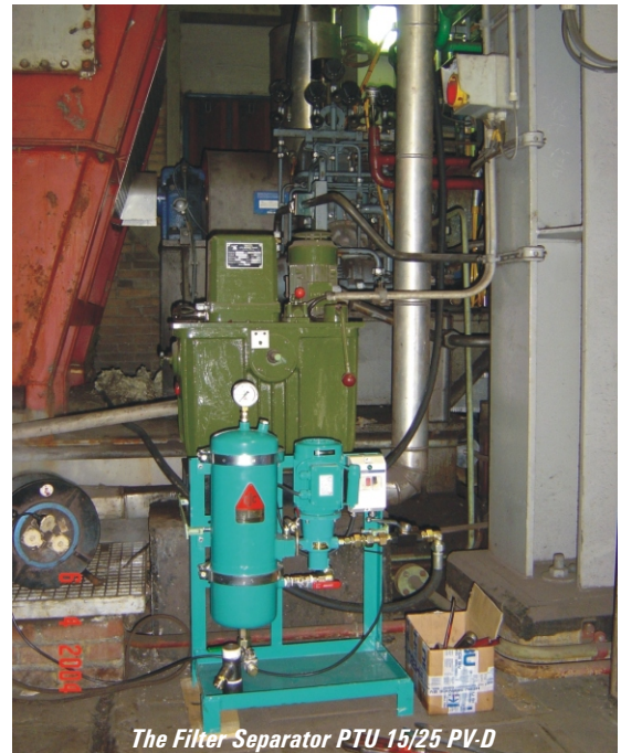
The Filter Separator PTU 15/25 PV-D

After 7 days the water contamination was under control and particle contamination was reduced to ISO Code 16/14/10. The first oil sample included a large quantity of sludge, resins and particles which coloured the oil dark brown. After 16 days the oil became clear and light coloured. Cost savings were made from extended service intervals, less manpower, less oil usage and most importantly less down time. The life of components, bearings and valves were extended by a factor of four. Return of investment within six months.