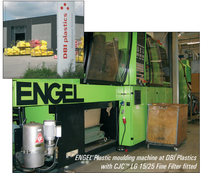
ENGEL Plastic moulding machine at DBI Plastics with CJC™ LG 15/25 Fine Filter fitted

Going through the oil samples taken recently, we discovered a machine, which has used the same oil for a period of 16 years! (see the table to the right for results)