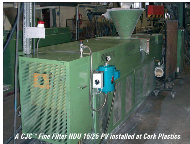
A CJC™ Fine Filter HDU 15/25 PV installed at Cork Plastics

According to diagnostics this cleanliness level should give a bearing Life Extension Factor of 6 .