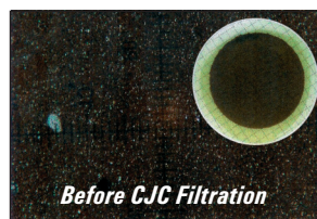
Before CJC Filtration